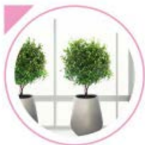
Flowers & Plants